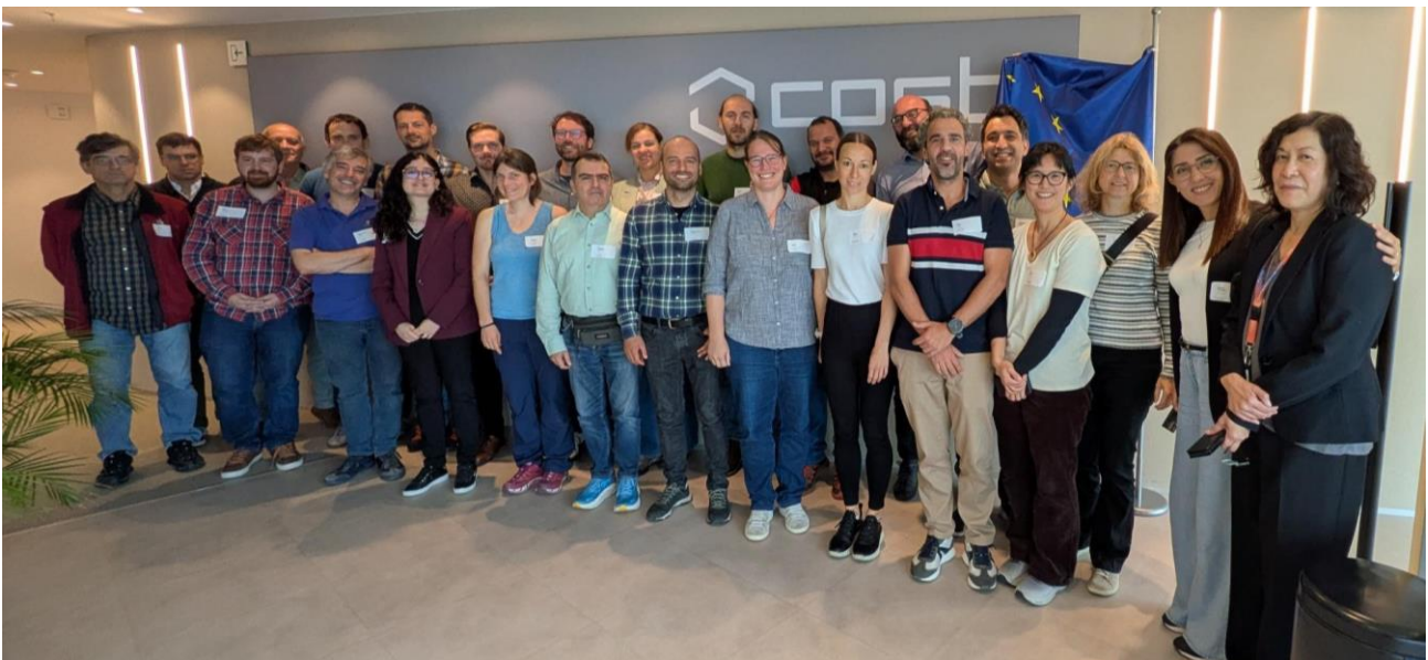
Management Committee members of PermaCOST were hosted by the COST Association in Brussels in early October 2025 to launch the Action