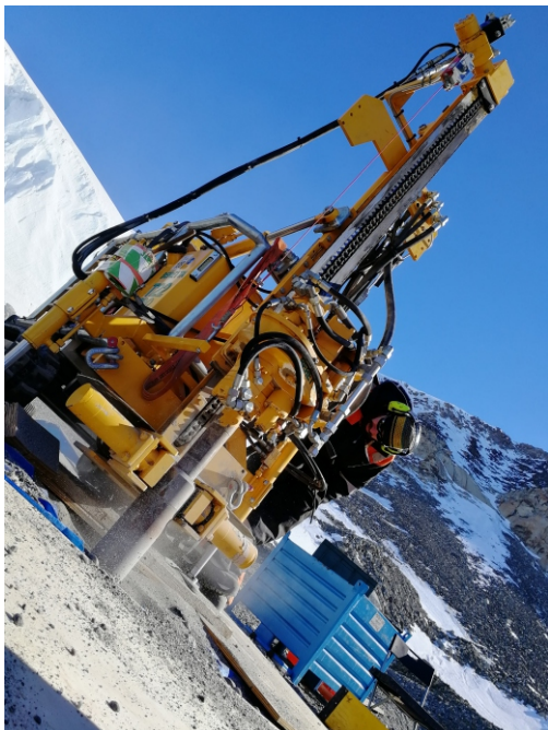
Stefano Ponti (Università degli studi dell'Insubria, Italy)

Active retrogressive thaw slump, Peel plateau along the Dempster Highway, NT, Canada. 14 June 2018.