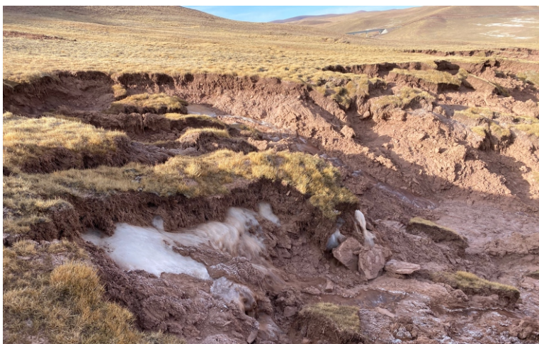
Chunlin Song (Sichuan University)

Thaw slump and exposed ground ice at Fenghou Mountain in the Qinghai-Tibet Plateau permafrost region, China. 23 October 2020.