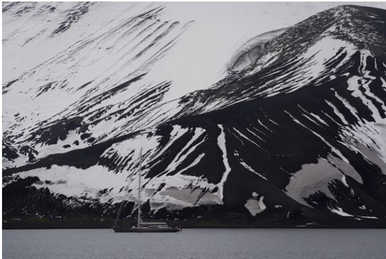
Catarina Guerreiro (MARE, Portugal)

Northern Antarctic Peninsula. January 2019.