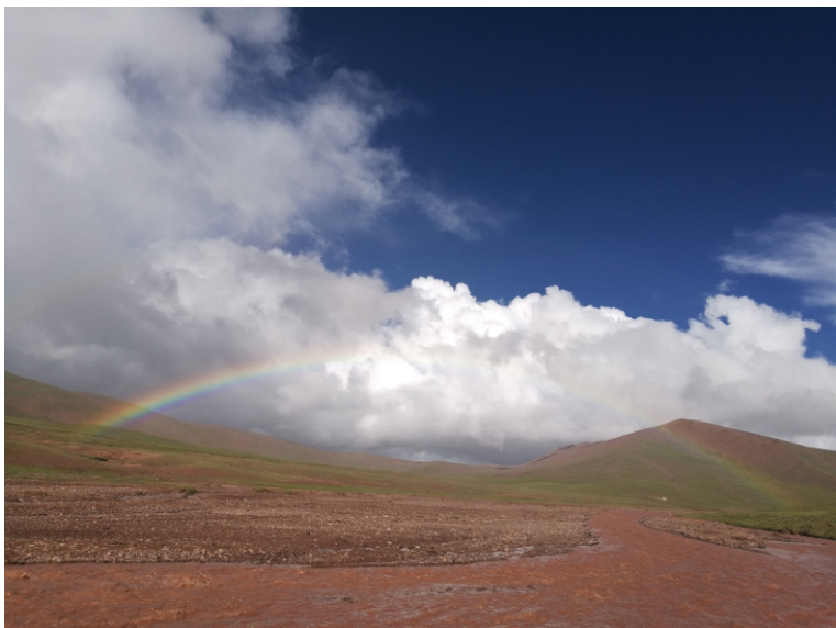
Kewei Huang (Chinese Academy of Sciences)

Flight over low-center polygons in the Teshekpuk Lake Region, Arctic Coastal Plain, Northern Alaska. 15 July 2015.