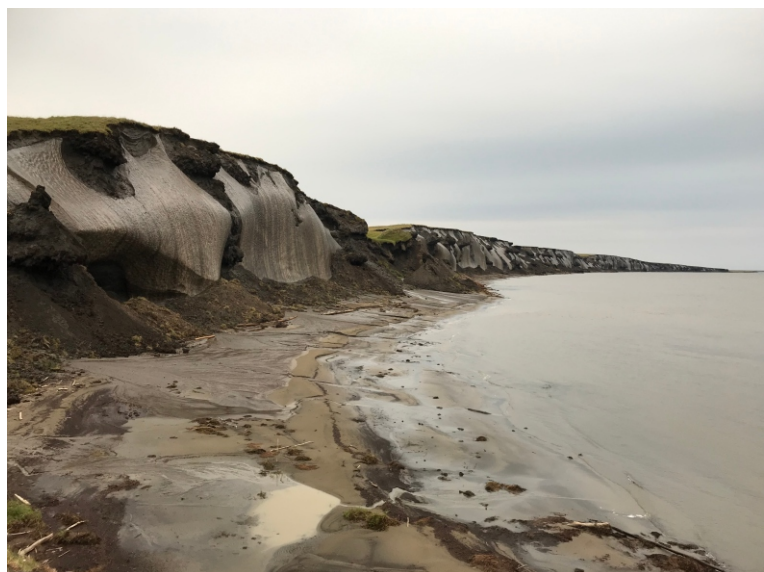
Matthias Fuchs (AWI, Germany)

A flood occurred during the thaw season at the Fenghuoshan watershed with rainbow over the river (4733 m.a.s.l.). 8 August 2018.