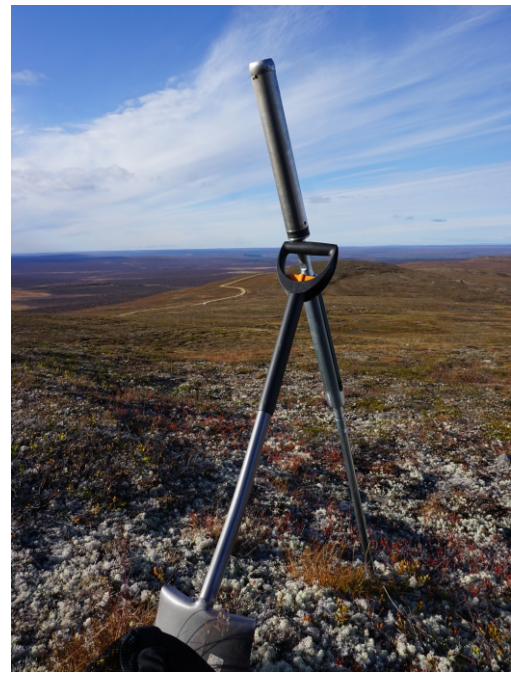
Nele Lehmann (AWI, Germany) Taking a break from soil coring, Iskorasfjellet, Norway. 27 September 2020.