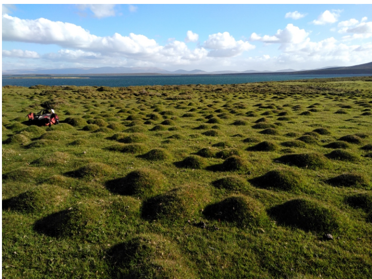
Francesco Malfasi (Università degli studi dell'Insubria, Italy) Frost hummocks along the south coast of Saunders Island (Falkland Islands). February 2017.