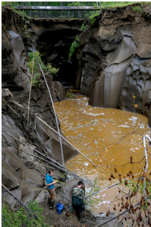
Luwig Jardillier (Université Paris-Saclay)

The cold heart of Earth. Terra Nova Bay (Antarctica). Operator that drills a borehole into coastal permafrost in front of a glacier terminus. 13 November 2019.