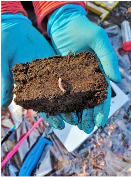
Charlotte Haugk (Stockholm University, Sweden) Finding life in northern soils, Abisko. September 2020.