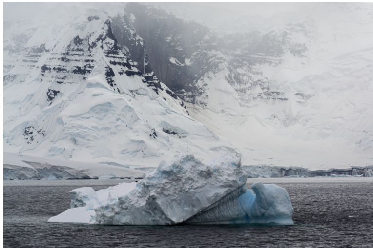
Catarina Guerreiro (MARE, Portugal)

Northern Antarctic Peninsula. January 2019.