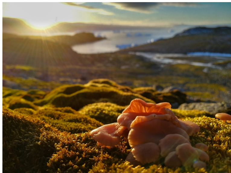
Stefano Ponti (Università degli studi dell'Insubria, Italy) Cushion of life. Signy Island (Antarctica). A specimen of Antarctic mushroom growing on a cushion of mosses. On the background ice blocks in the bay. 8 March 2018.