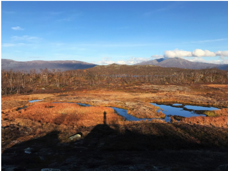
Charlotte Haugk (Stockholm University, Sweden)

Northern Antarctic Peninsula. January 2019.