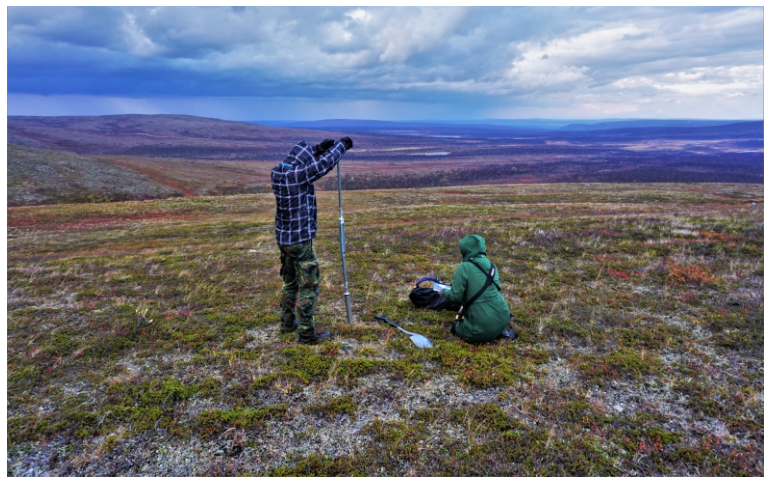
Nele Lehmann (Alfred Wegener Institute, Germany)

First Fieldwork of my PhD in Abisko am investigating the release of Hg from thawing permafrost, northern Sweden. September 2020.