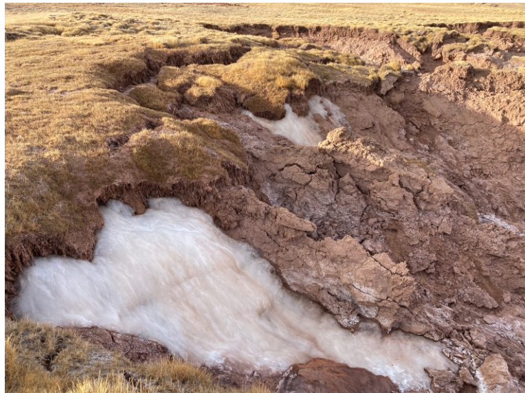
Chunlin Song (Sichuan University)

Thaw slump and exposed ground ice at Fenghou Mountain in the Qinghai-Tibet Plateau permafrost region, China. 23 October 2020.